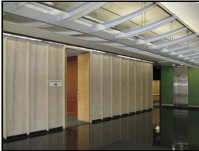
Entrance off 1 st Floor Lobby