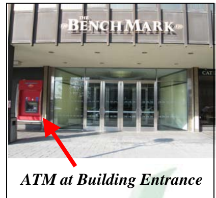
ATM at Building Entrance