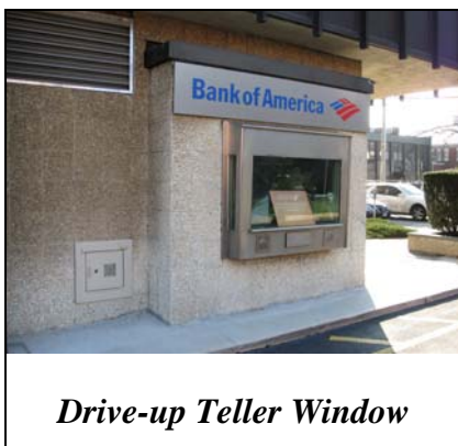
Drive-up Teller Window

This Class-A office building located in the heart of the Mineola business district is the perfect location for a retail bank or any service related business looking to tap into this high volume commercial market. Building signage is available and plans are in place to add a new covered parking garage. There is an on-site café and the building is within walking distance to the LIRR, bus stops, and the County Courts.